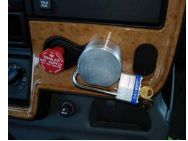
Figure # 4

INSTALLATION INSTRUCTIONS FOR COMMERCIAL BENDIX CONTROLLER VALVE