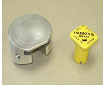
Figure # 1