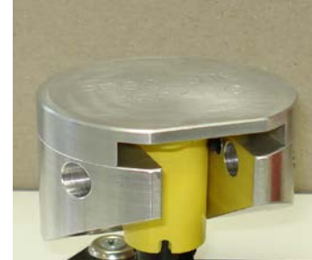
Figure # 3