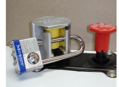
Figure # 4