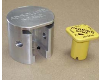
Figure # 1