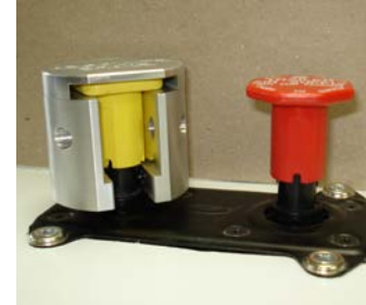
Figure # 3